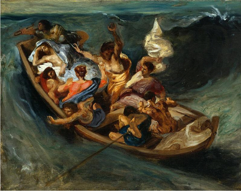
Eugène Delacroix, Christ on the Sea of Galilee , painting, 1841, Nelson-Atkins Museum of Art, Kansas City, MO

Holy Eucharist Service June 23, 2024, 5:00 PM